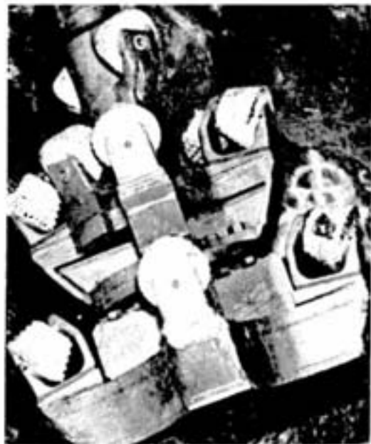
This old-style five-foot reaming head was called a "Christmas tree" because of its shape and its 12 cutters which resembled ornaments. Compare with the flat seven-foot head on page 9.

The power output is stepped down to 550 volts by a 225 KVA transformer.