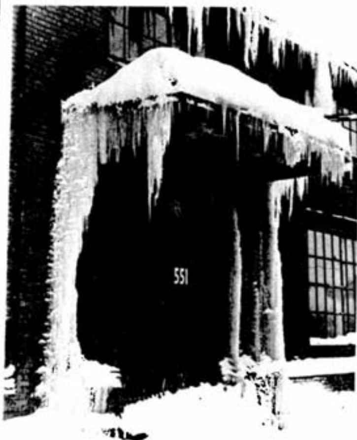
An ice stalactite hangs from the tailings line.