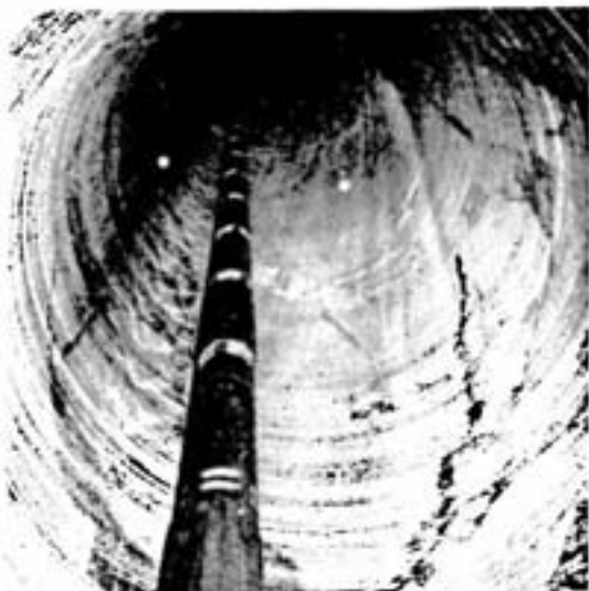
Looking up the partially completed ore pass, the shaft is the 10-inch drill rod to which the reaming head is attached. The smooth-walled circular hole is preferred when the raise is to be used for ventilation. Air resistance is much lower than in a conventionally drilled and blasted rectangular hole.

Turning at 72 rpm, the three-cone rotary pilot bit is made of alloyed steel studded with tungsten carbide "buttons". When