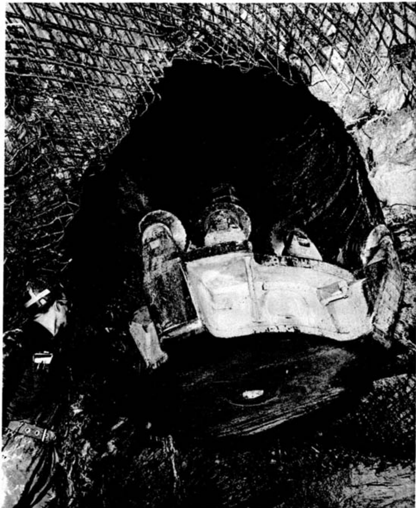
Raise bore boss Lloyd Hartley inspects the giant seven-foot reaming head. It weighs six tons. Lowered for photographic purposes, the head actually bored the entire 523-foot raise without being removed.