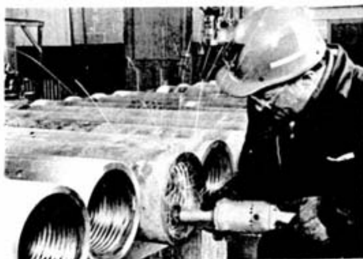
At the Frood diamond drill warehouse, maintenance mechanic Mike Pillarella cleans and dresses the threads of the drill rods. The rods are recovered from the raise or pass being bored, are returned to the warehouse for refurbishing and are reused when required again.

A 150-hp motor, mounted between the two chrome steel main guide cylinders in the upper structure, drives the raise borer.