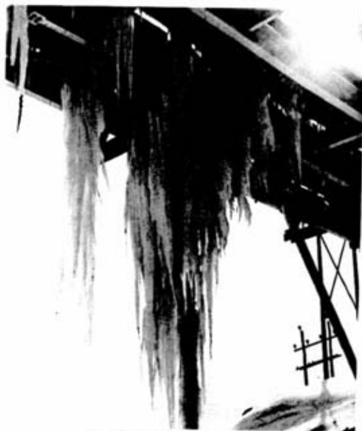
A silver archway in shops alley.