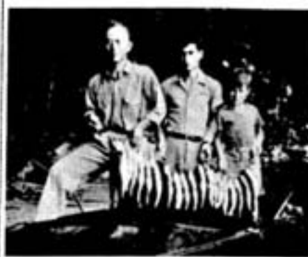
BEST CATCH IN 14 YEARS